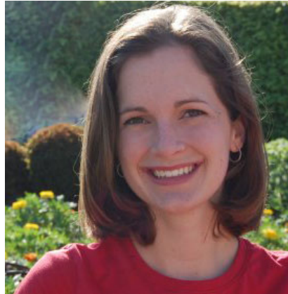
K i e r s t