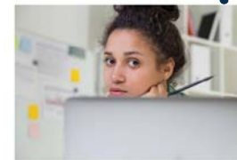
How to Use Drop-in Tutoring