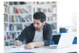
How to Use Writing Feedback