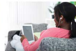
How to Use a Whiteboard