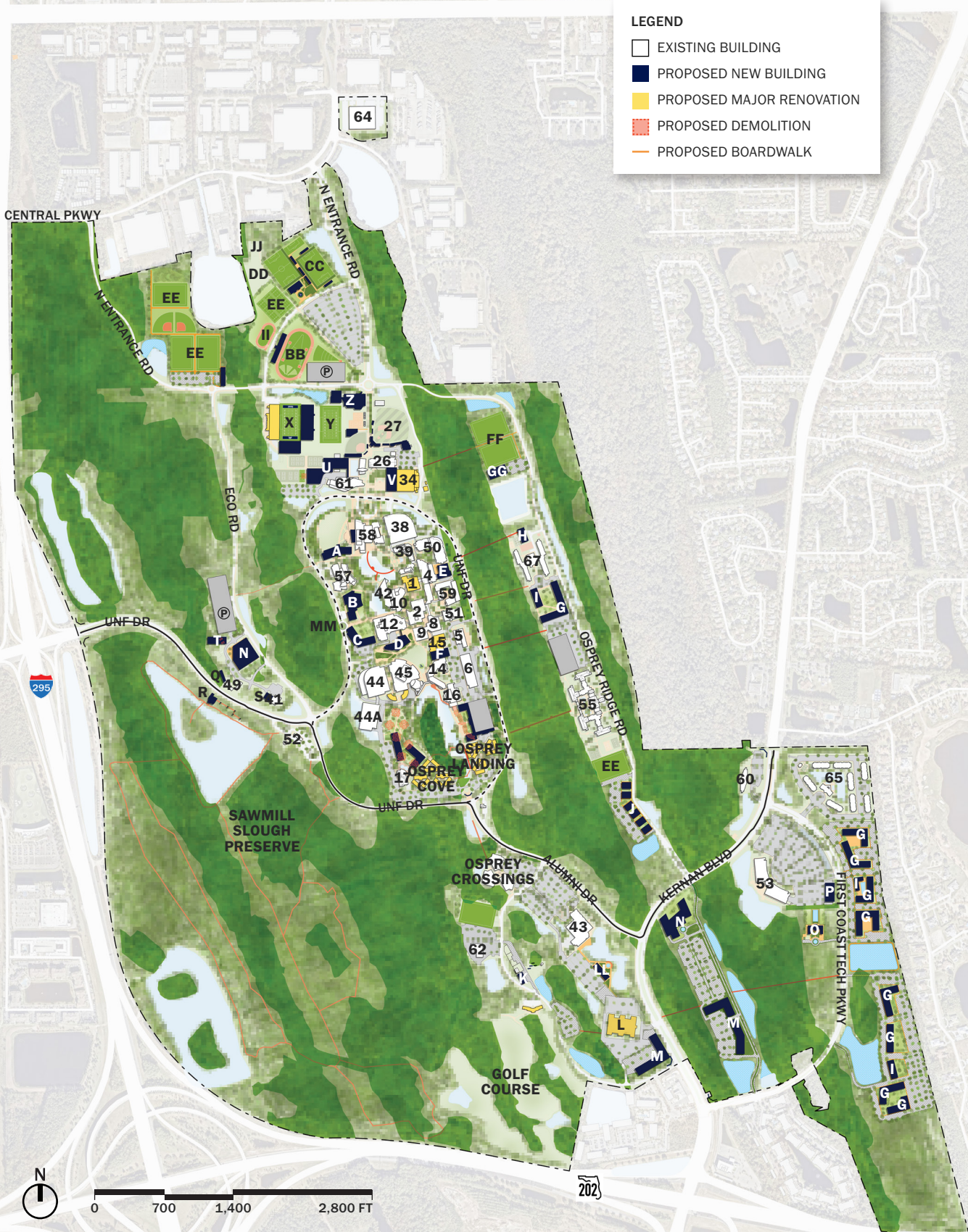
FIGURE 1.1: PROPOSED CAMPUS PLAN