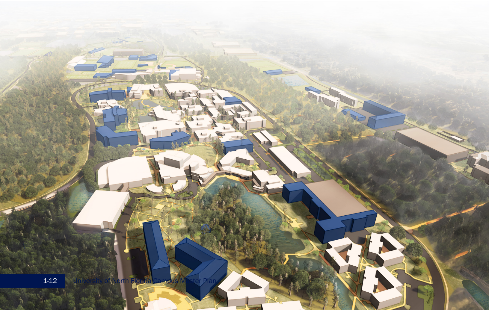
Bird's eye view of proposed campus plan with new facilities noted in blue, looking north.

A number of infrastructure improvements will be needed to make sure that existing and future buildings are adequately served.