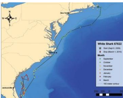
Fig. 1 – Southern migration of a white shark tagged in the north Atlantic in 2009

Recent research has shown that white sharks migrate south to the waters off the southeastern US during winter months (Fig. 1).