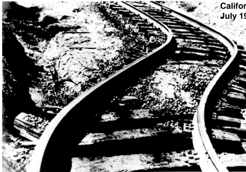
California July 1952