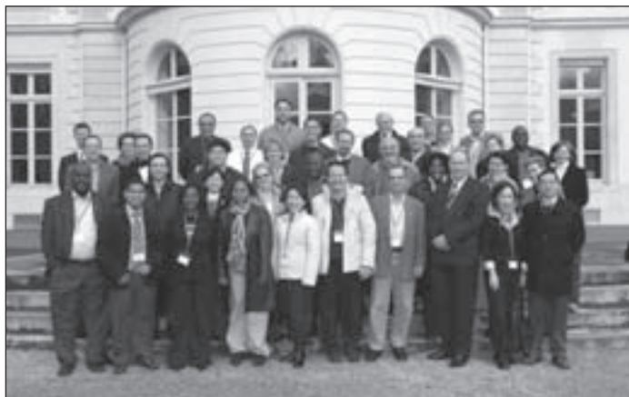
WMA/CPW Leadership Course 2007

The goal of Phase IV was to address the emergent need for development of physicians' advocacy and leadership skills. Throughout 2006 and 2007 the WMA, in collaboration with INSEAD and again with the partnership of Pfizer, Inc., developed the WMA/CPW Leadership Course . The program was designed to develop the skills and knowledge needed for medical and social leadership, enhancing the abilities of medical professionals to advocate